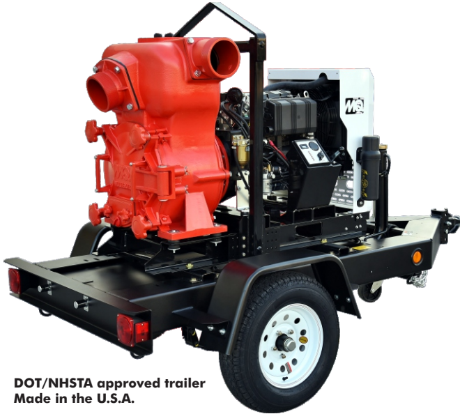
DOT/NHSTA approved trailer Made in the U.S.A.

The Multiquip MQ62TKT Trash Pump - is the perfect choice for demanding dewatering applications. The trusted MQ pump-end produces exceptional flow rates, easily handles high debris laden water, and maintains long operating life due to the strength of its industrial engineered casings and components.